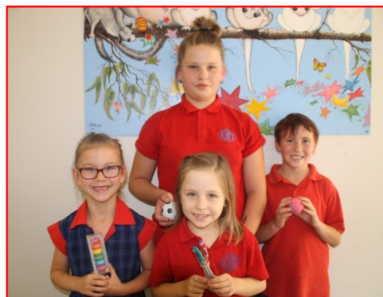
Week 8 PBL Draw Winners