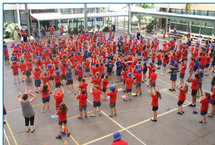
The whole school has been practicing the 'Finale' dance daily.

Our dedicated P&C will be hosting a BBQ again this year. Dinner and drinks will be available from 5.00pm and everyone is welcome. Any help to serve on the night would be greatly appreciated.