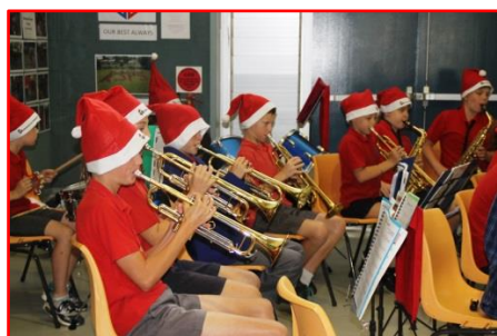
Our Talented Band