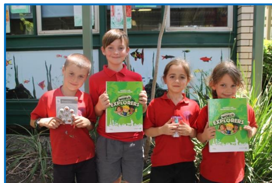
Our Week 7 PBL Draw Winners

Thank you also for showing CLASS in the classroom: Co-operating , Listening , having a positive Attitude , being Sensible and Studious .