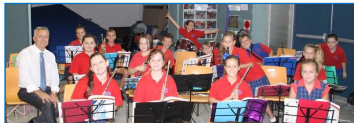
Members of the KSPS School Band