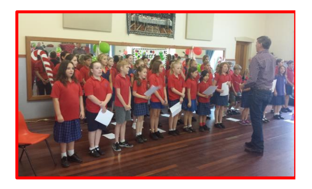
The enthusiasm and talent of our choir was enjoyed by all.