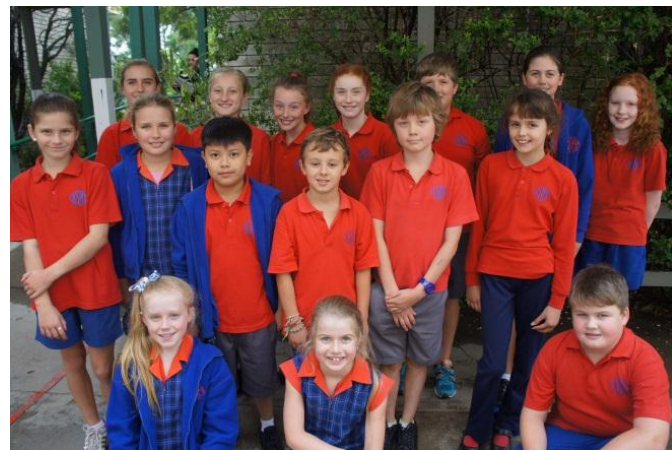
Representatives of our school band who performed at the combined concert.

Congratulations to all our students for their dedication.